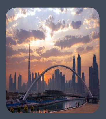
Dubai Water Canal