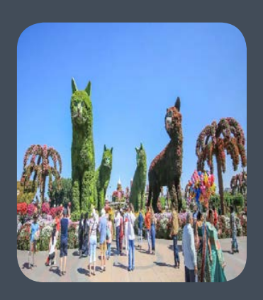
Dubai Miracle Garden