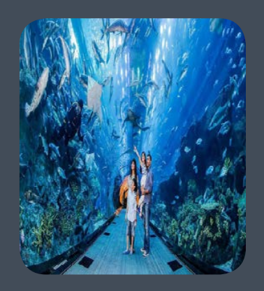
Aquarium and Underwater Zoo