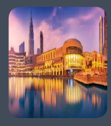
The Dubai Mall