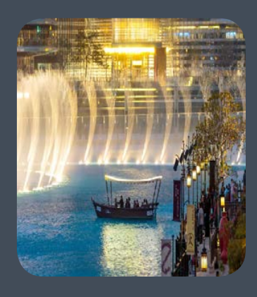
The Dubai Fountain