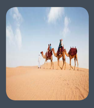
The Dubai desert