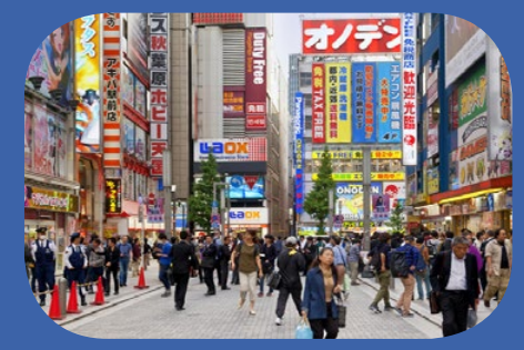
Akihabara Electric Town