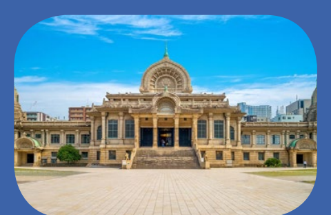
Tsukiji Hongan Ji