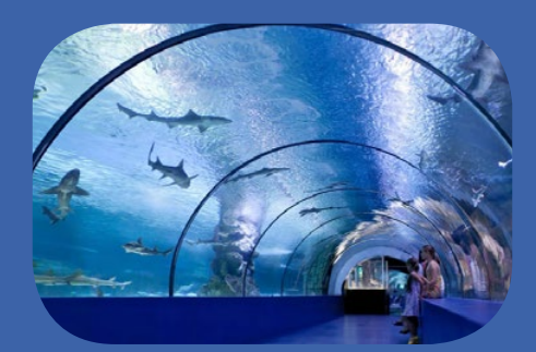
Osaka Aquarium Kaiyukan