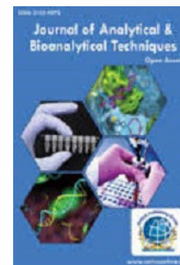
Journal of Analytical & Bioanalytical Techniques