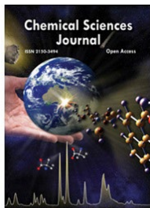
Chemical Sciences Journal