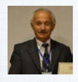
Firat University Turkey