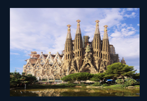
Basilica de la Sagrada Família