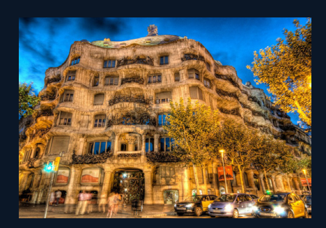
Casa Mila (La Pedrera)