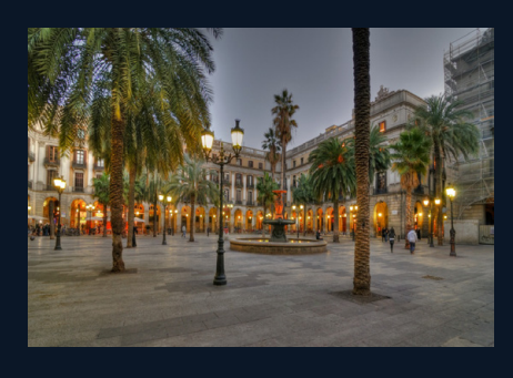
La Rambla Barcelona's Social Hub