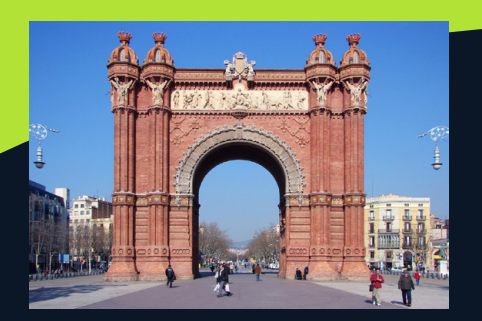
Arc de Triomf