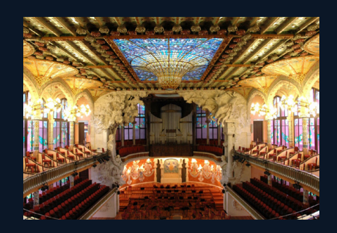
Palau de la Música Catalana