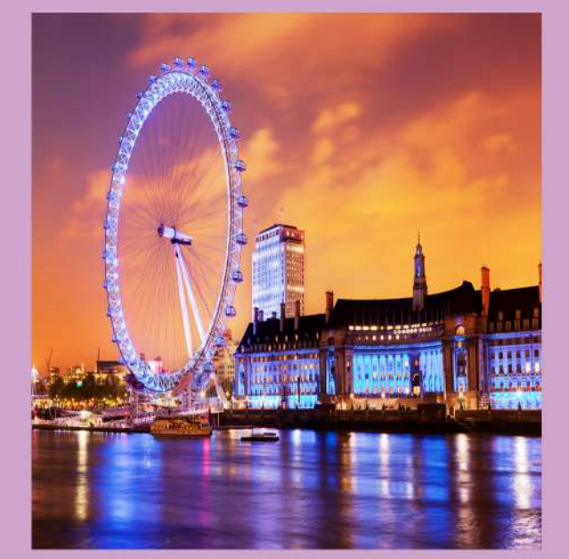
Coca-Cola London Eye