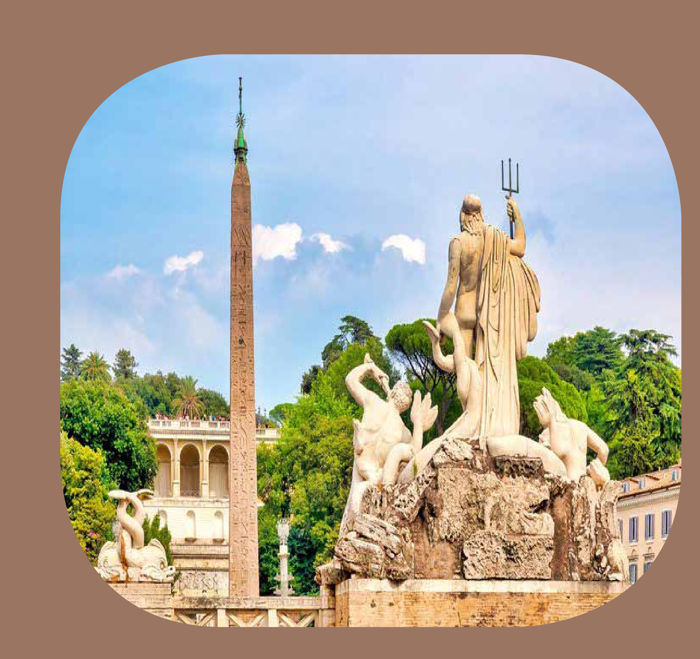
Santa Maria del Popolo