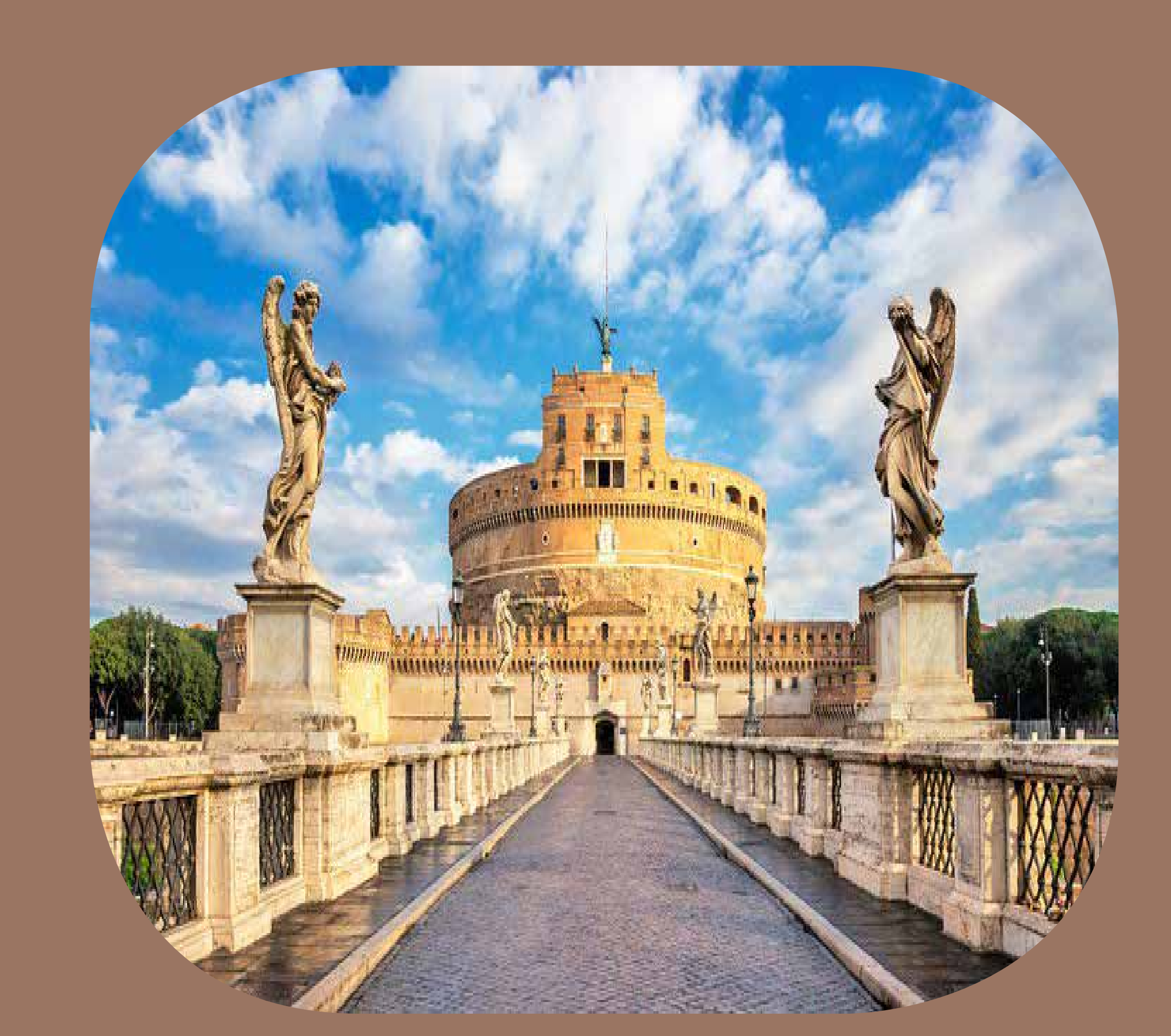
Castel Sant'Angelo National Museum