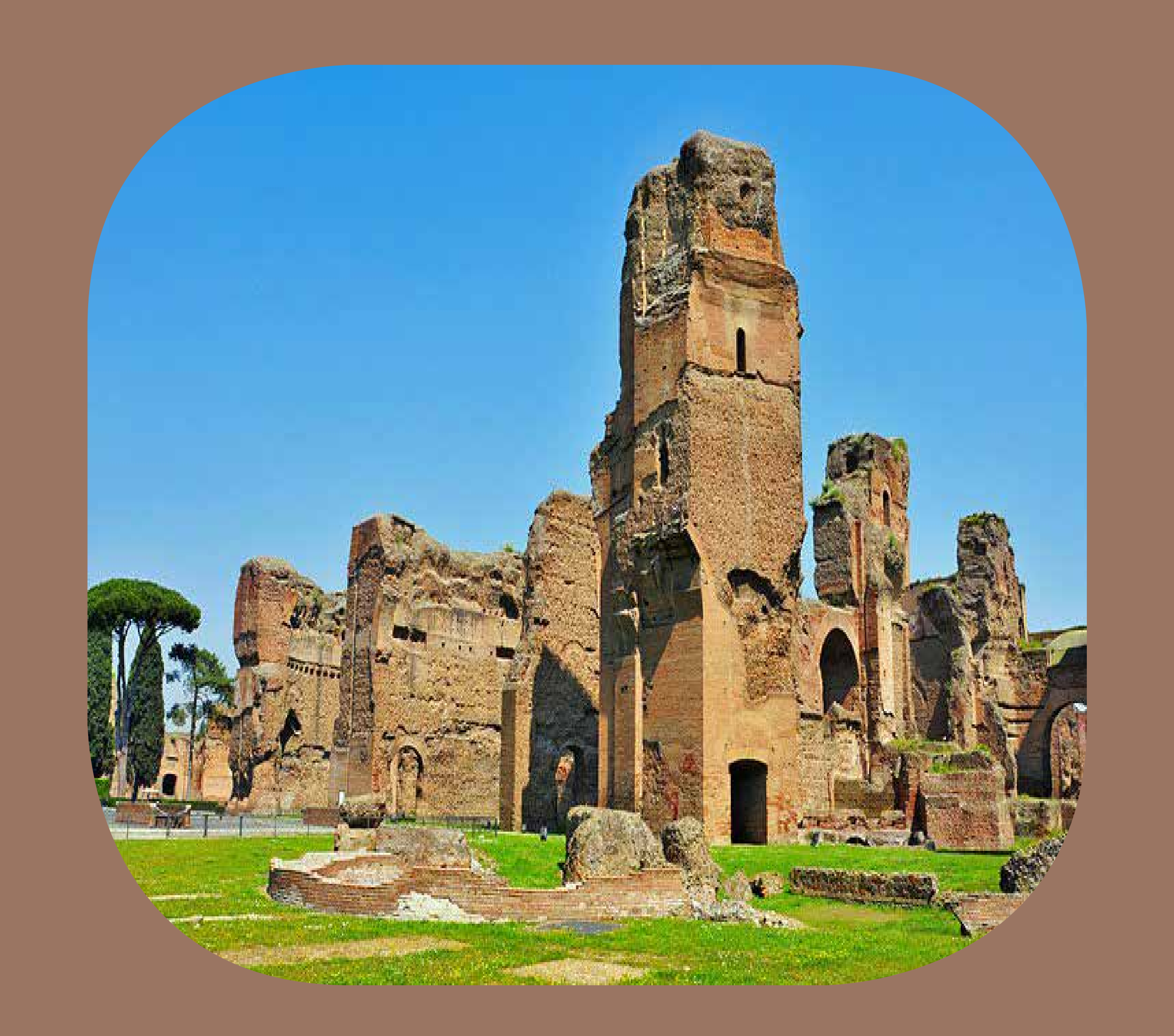
Baths of Caracalla