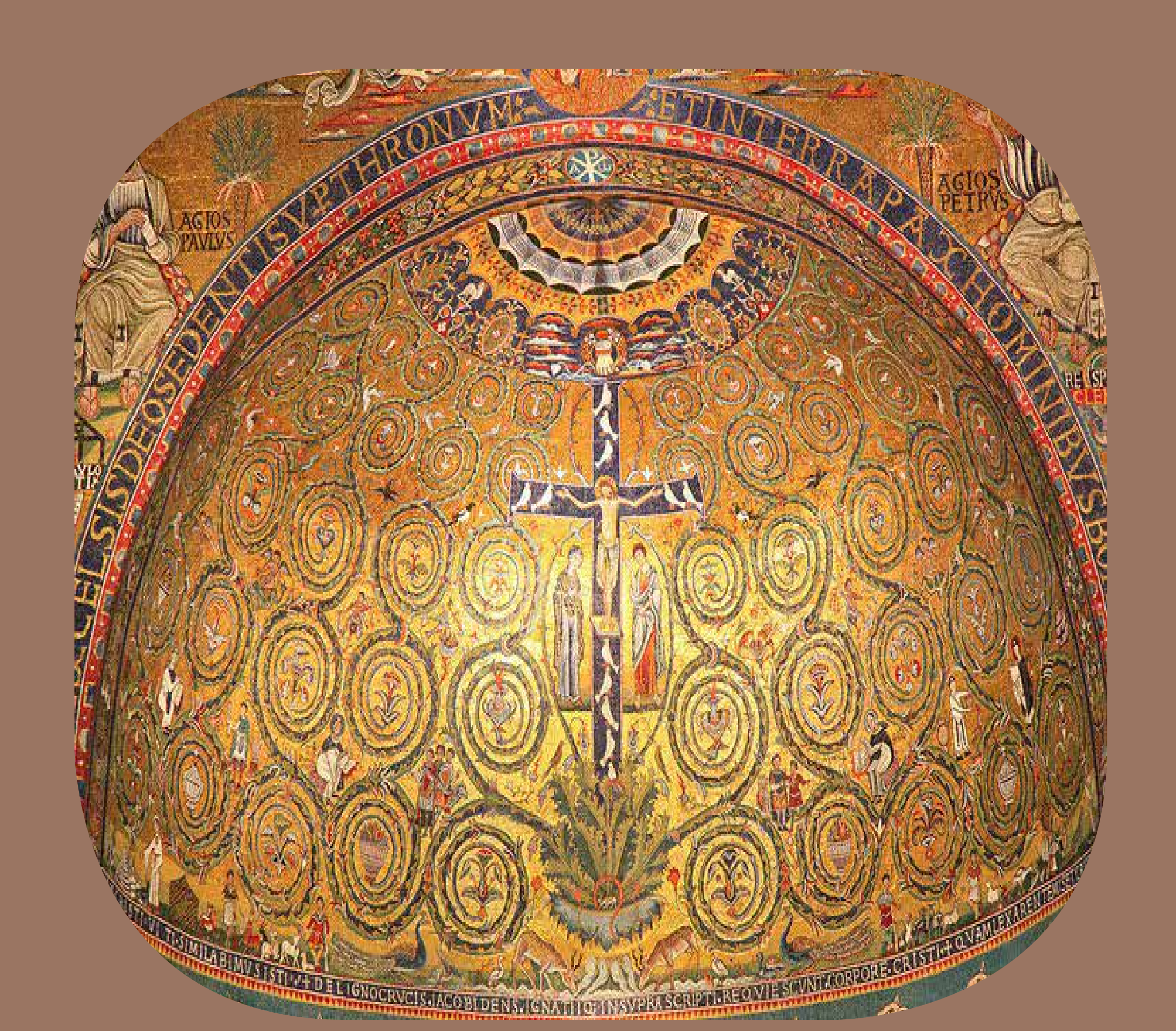
Church of San Clemente