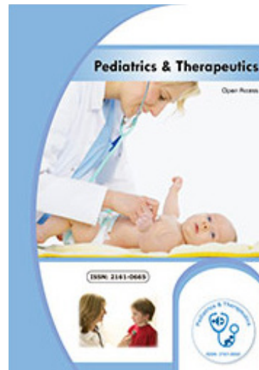
Pediatrics & Therapeutics