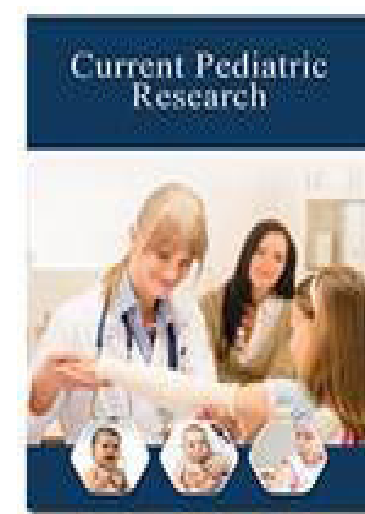
Current Pediatric Research