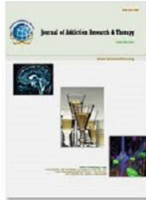
Journal of Addiction Research & Therapy